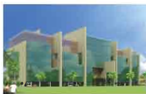
Olympia NCR Noida IT park