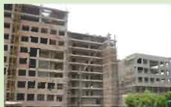
View From Beverly Park

The construction of Time Tower is in full swing. Through this section, we will keep you posted on the progress of the project and review the schedule on a regular basis.