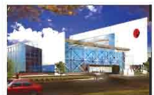
Located on sector 54, next to Suncity Township in Gurgaon

Located next to the Gurgaon Golf Course amidst affluent surroundings is Suncity ABW's premium residential project