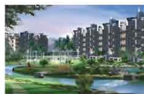
Golf Course Road, Suncity Gurgaon

Office Complex & Shopping Completion March 2008 Area: 50,000 Sq.ft.