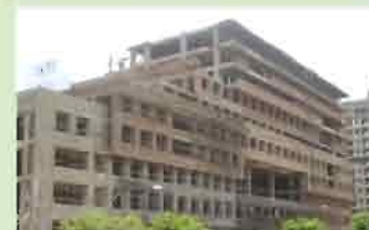
Side View From MG Road