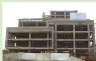
Front view from MG Road