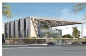
Golf Course Road, Gurgaon

750,000 Sq.ft, IT Park Gym, Food Court, Auditorium Completion 2008, Heart of IT Hub